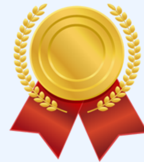
Best River Rejuvenator Award