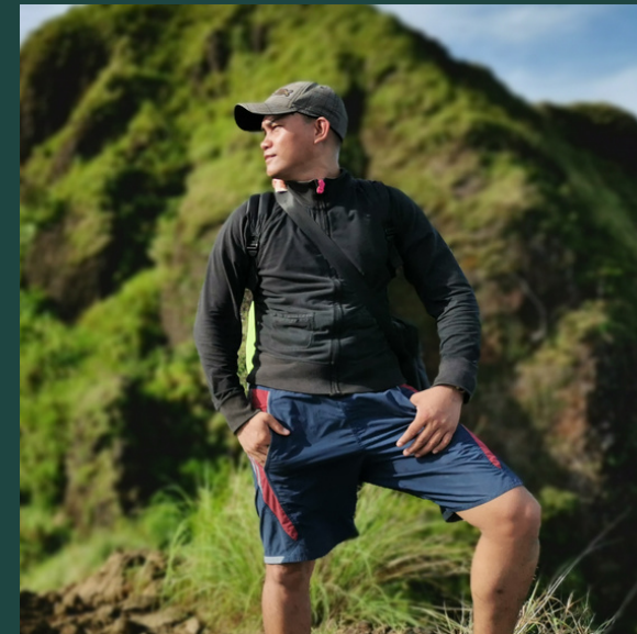
Best River Scientist of the Year