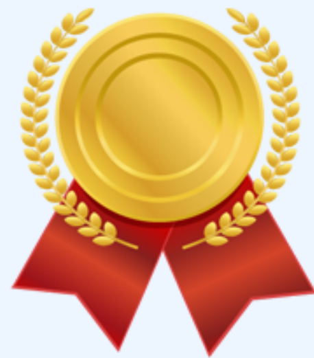
Best River Governance Award