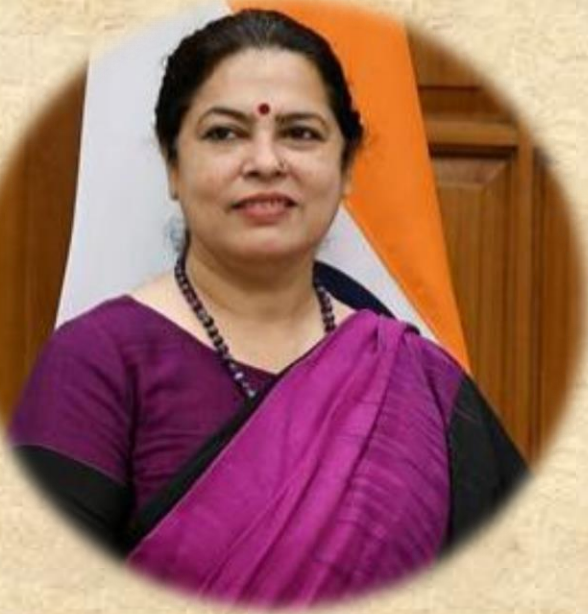
Smt. Meenakshi Lekhi

Hon'ble Union Cabinet Minister Ministry of Culture & Ministry of External Affairs, Govt. of India